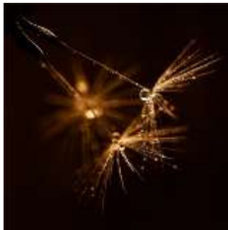
Viv Harpur 'Passing Stars'