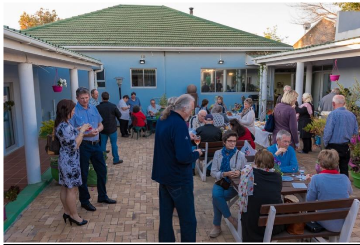
Outside for drinks and snacks