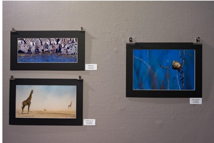
Some of the prints