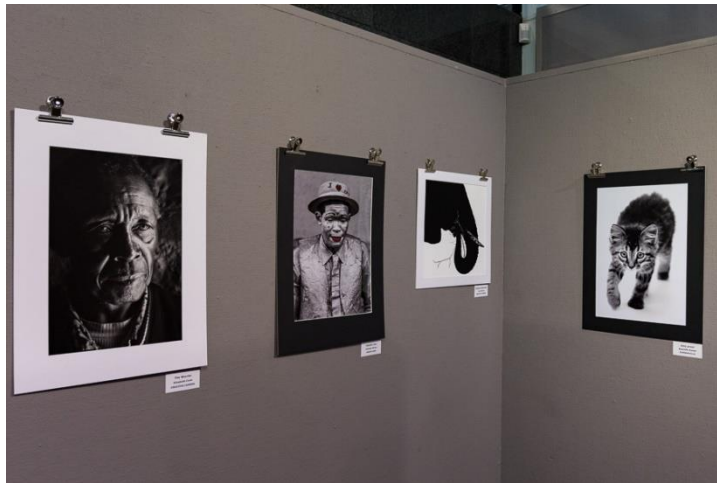
Black and White