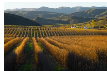
3 rd : Scheeperspost Peter Dewar Open : Prints

The full results can be found on the club website at https://helderbergphoto.com/scores