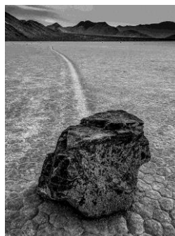
2 nd : Yes I did Hilldidge Beer Set : Projected