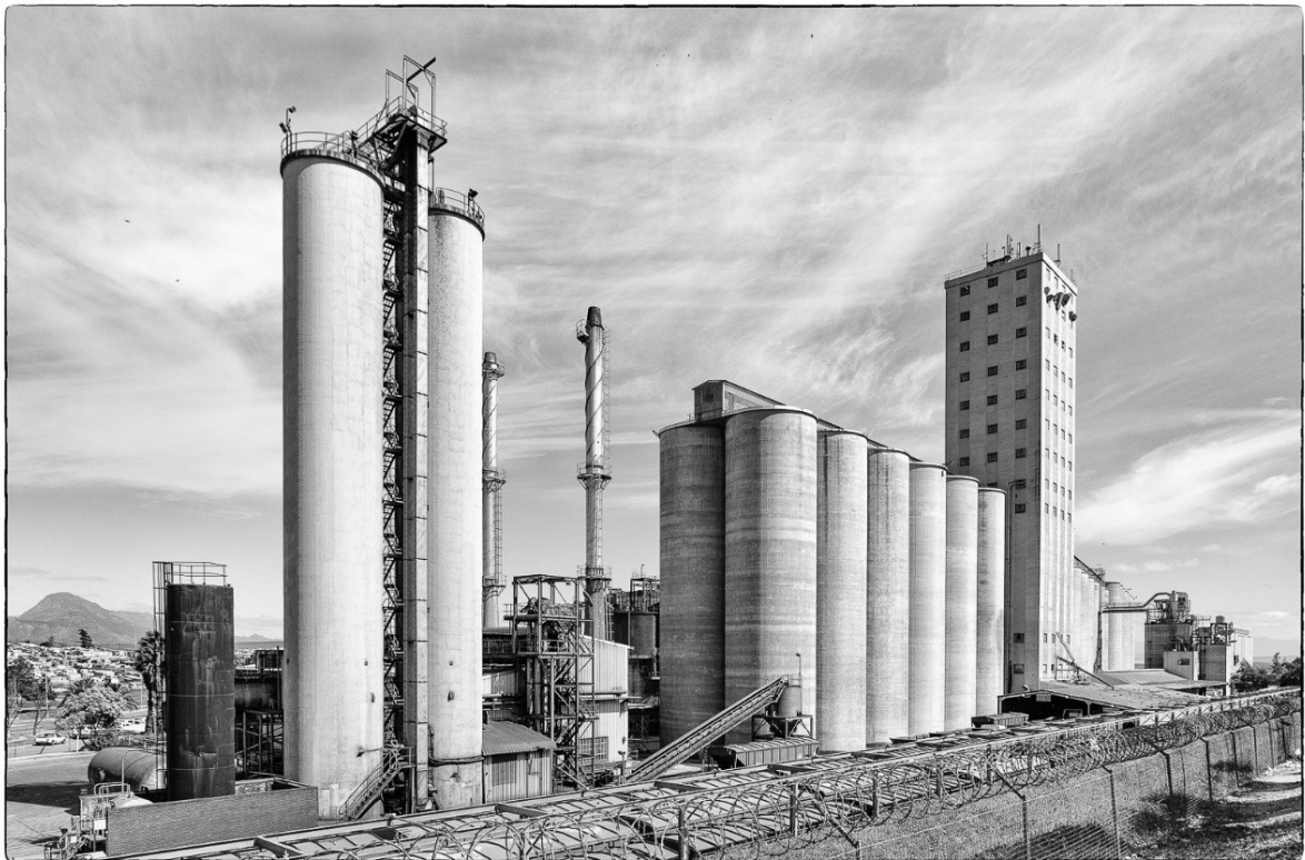
Best Black and White Image : Steve Trimby : "Caledon Silos"