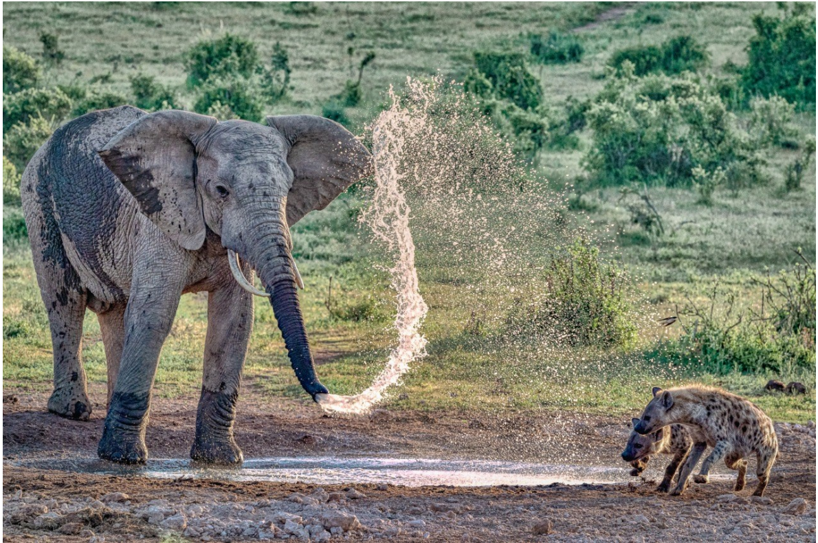
Best Colour Image : Mike Hodgson : "Stay Away"