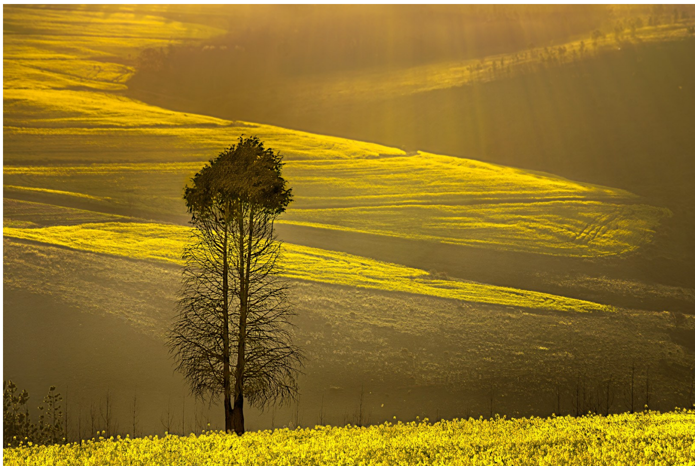
SEPTEMBER 2022 Set Subject : Drama of Light 3rd Place : Peter Dewar : "Canola Season" : Set Subject Print : 27 Points