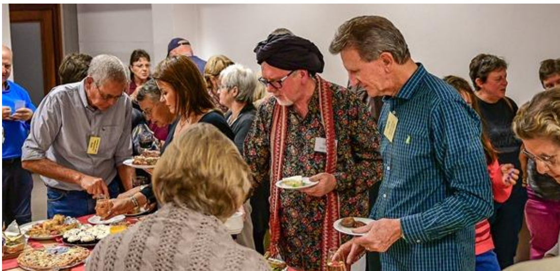
was a feast!