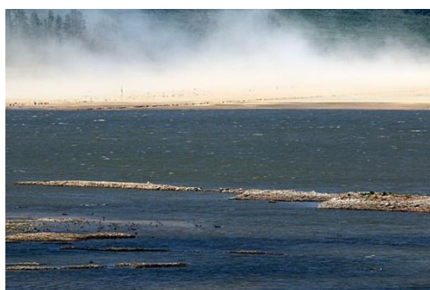
Dust storm at Theewaterskloof dam