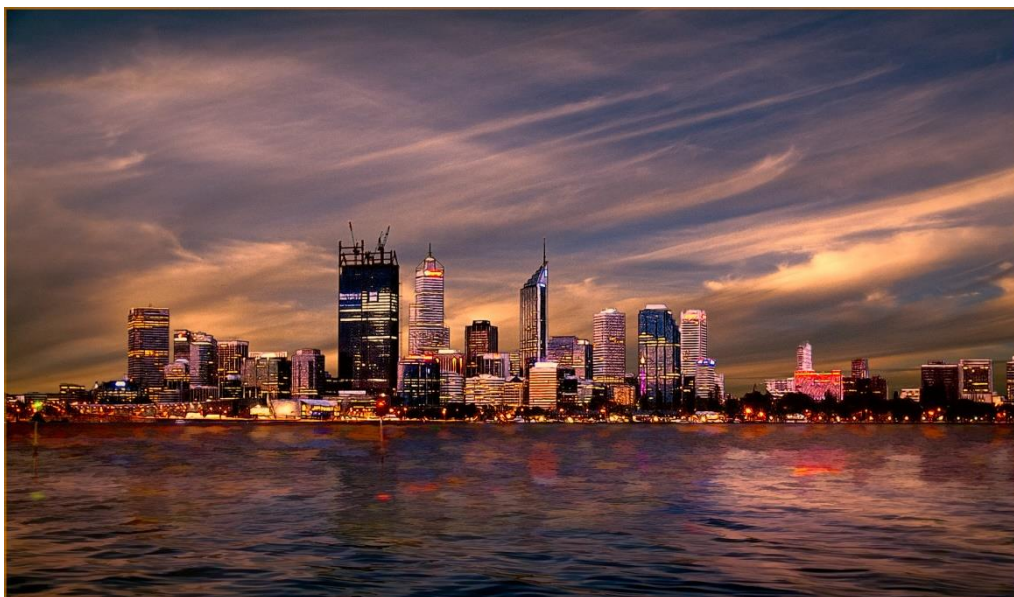
Perth Skyline