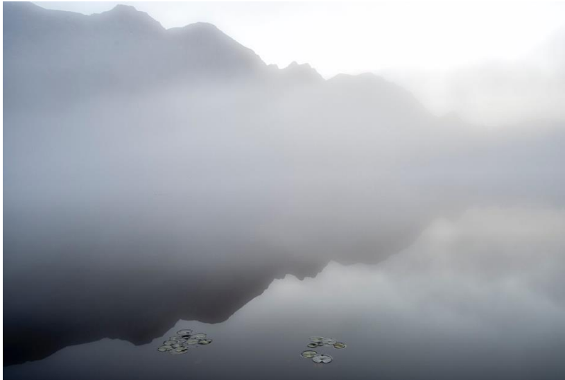
Izak van Niekerk 'Before