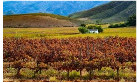
In May the Montagu vineyards will be colourful.