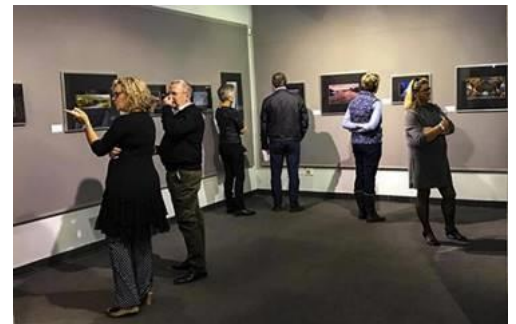
Visitors admiring the members' work on exhibit.