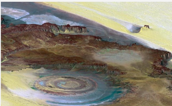
Richat Structure—Sahara Desert, Ouadane, Mauritania

Practice the art of achieving a new and interesting point-of-view no matter where you’re taking pictures.